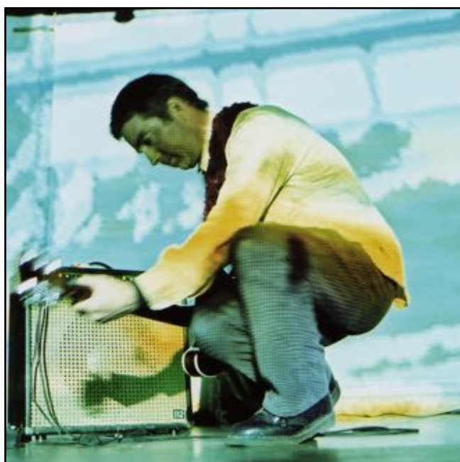
Lines of Flight Dunedin Fringe 2007

Fringe celebrates innovation, experimentation, and being brave. In this COVID times, even the most experienced practitioner should consider new ways of working - and where better to try new things than a Fringe Festival. Here's a link to an article with suggestions for socially distant theatre to get you thinking.