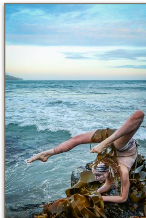
Elemental (Dunedin Fringe 2018)