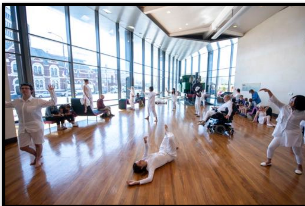
On Display (Dunedin Fringe 2019)