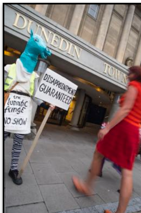
A1 The No Show, (Dunedin Fringe 2018)