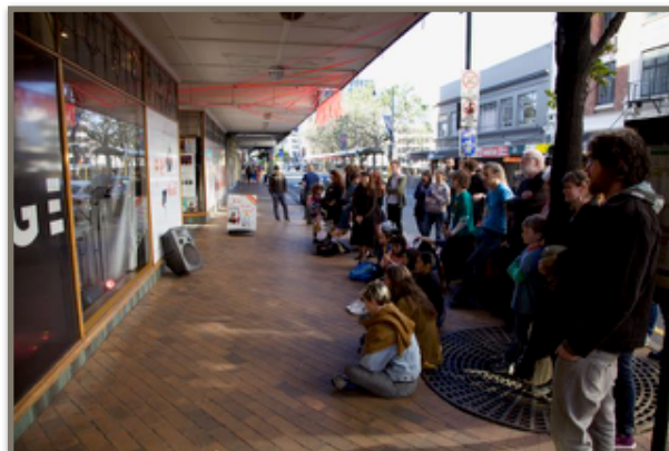
A crowd gathers on Princes St to watch a performance in 'The Black Box' @ Fringe HQ

As part of our registration process, you will be required to speak with us. Ideally, this will be in person but phone or Zoom also works. We recommend reading through this guide and taking notes about anything you're unsure about or would like to discuss further. Then contact the festival team to book a time to kōrero (talk). If you're based in Dunedin, Fringe HQ is 26 Princes Street - just a couple of doors from the Octagon.