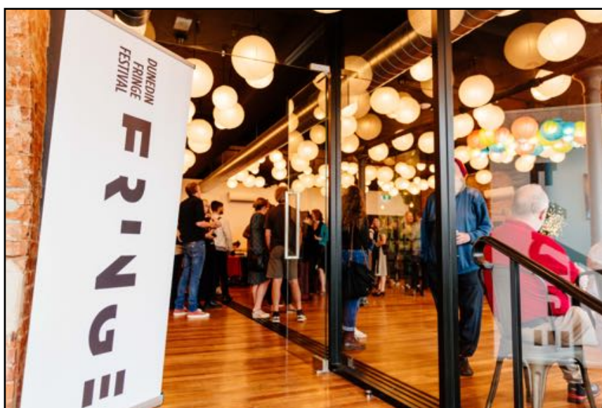
Dunedin Fringe Launch Event 2020

Keep using Eventotron after you've finished registering - you'll find useful Fringe documents stored there and it will link to the backend of our ticketing provider (so you can check your sales figures etc). You also need to undertake various post registration activities including: uploading your media release; letting us know about your artist passes; uploading reviews; and the link to your post-event survey.