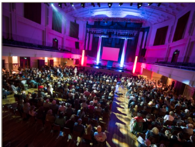
Opening Night Showcase (Dunedin Fringe 2018)