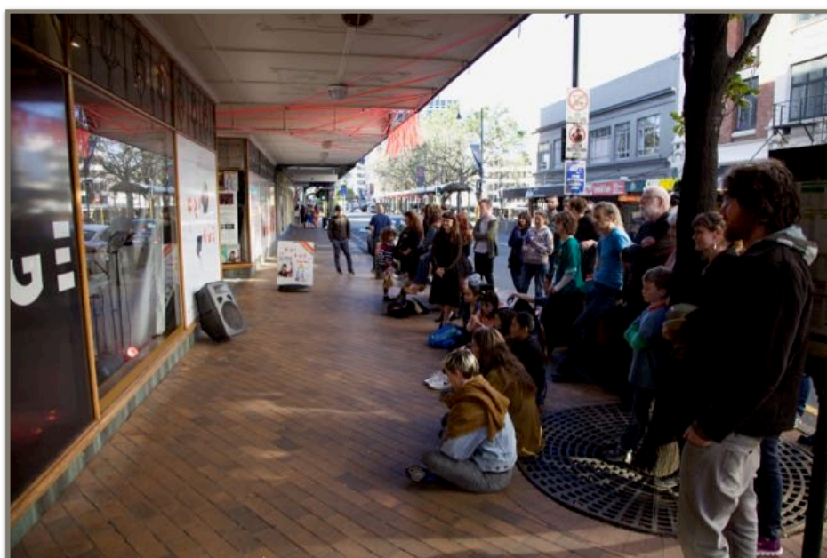
A crowd gathers on Princes St to watch a performance in 'The Black Box' @ Fringe HQ