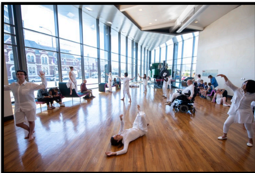
On Display (Dunedin Fringe 2019)