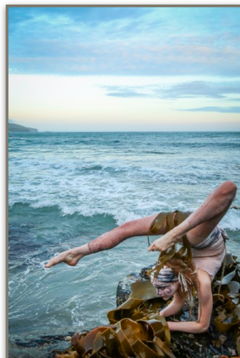
Elemental (Dunedin Fringe 2018)