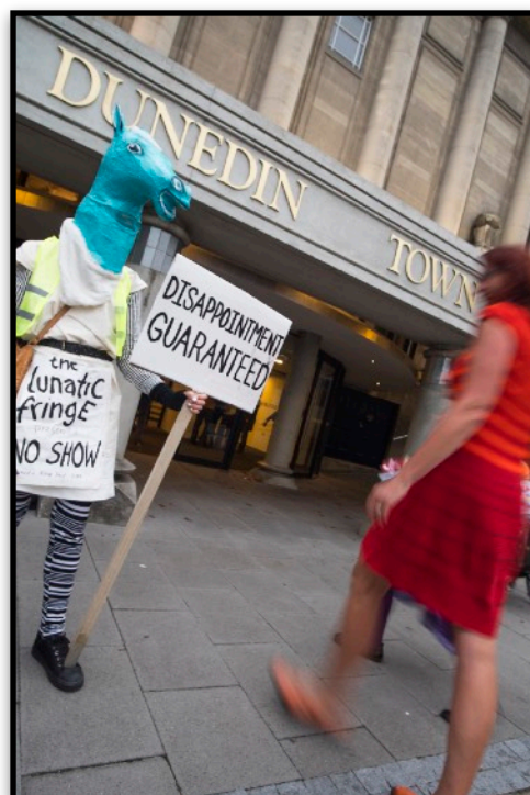
A1 The No Show, (Dunedin Fringe 2018)