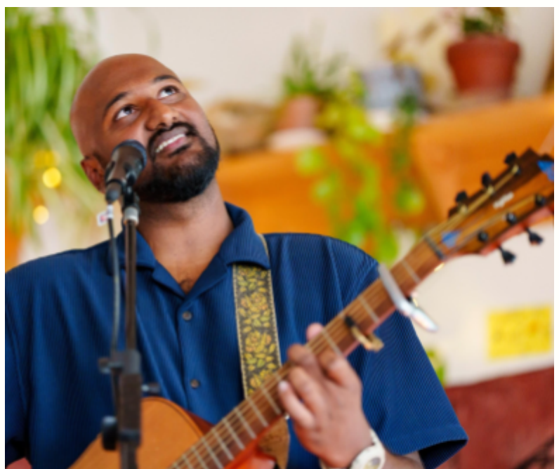
For My Family, And Yours, 2025.

Finding the right venue can be one of the biggest challenges, especially for events requiring professional theatre space. Dunedin has a mix of interesting cafés, bars, community spaces, and vacant shops, but only a few professional venues (true gems!).