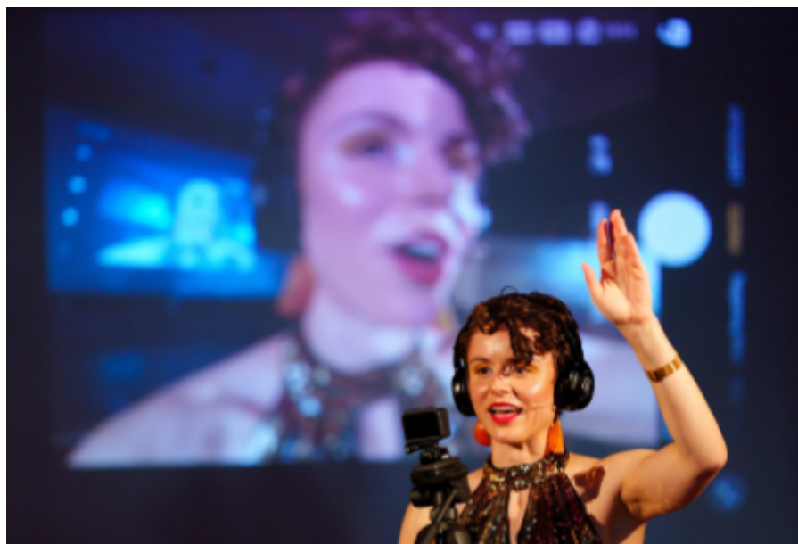
ASMR Hour, 2025.

For practical advice and resources, visit Arts Access Aotearoa's resources page .