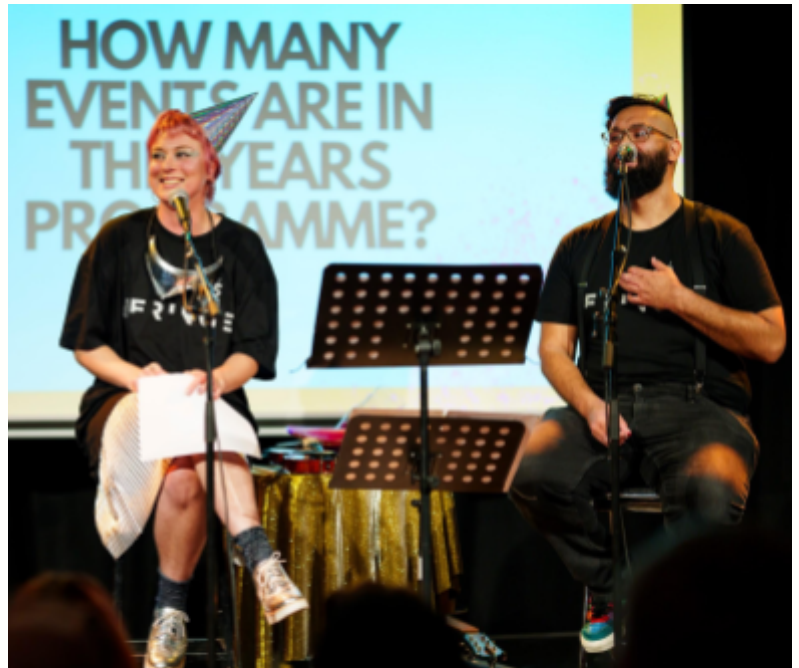
Syrup Bois, 2025.

All events must pay a registration bond of $50.00 in addition to the registration fee – this is refunded once you have completed an online Artist Event Report following the festival. This report is critical to the festival as it provides important data such as attendance figures and artist feedback, which helps us shape future festivals and secure funding.