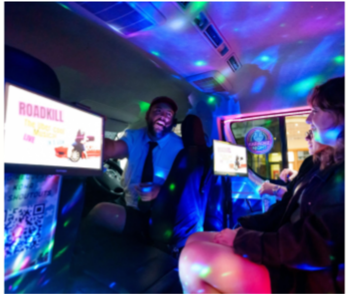
ROADKILL: The Uber-Cool Musical, 2025.

The venues in Eventotron are not the only options — contact us for advice or suggestions.