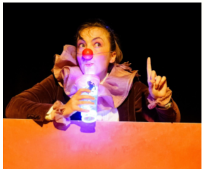
The Tiny Show, 2025.