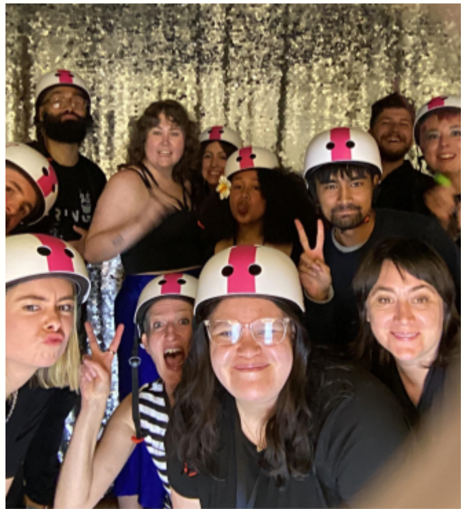
2025 Dunedin Fringe Team