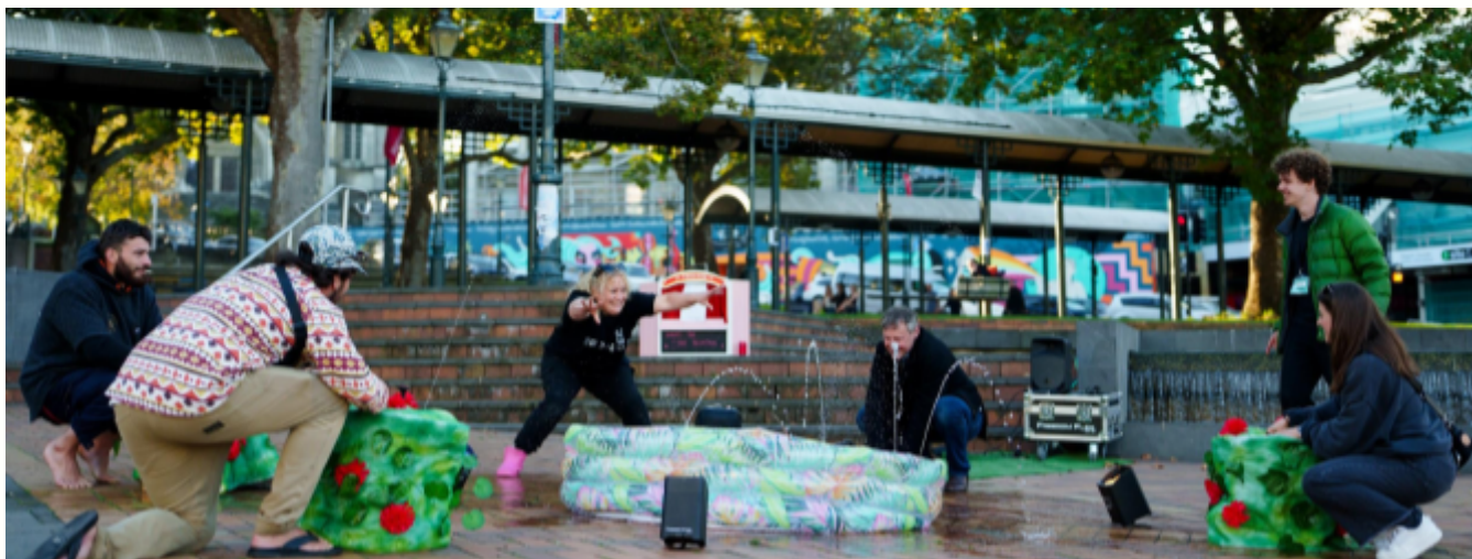
Bring Back The Star Fountain, 2025.