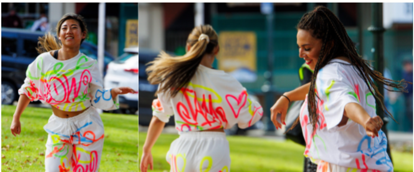
Glowjam, 2025.