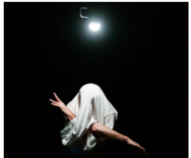
Only Bones, 2025.