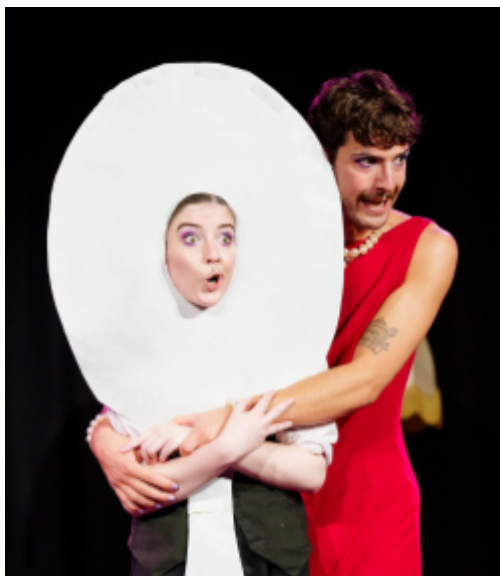
Delightfool, 2025.