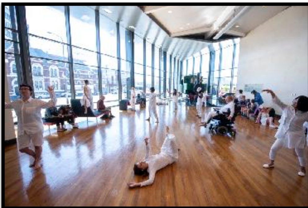
On Display (Dunedin Fringe 2019)