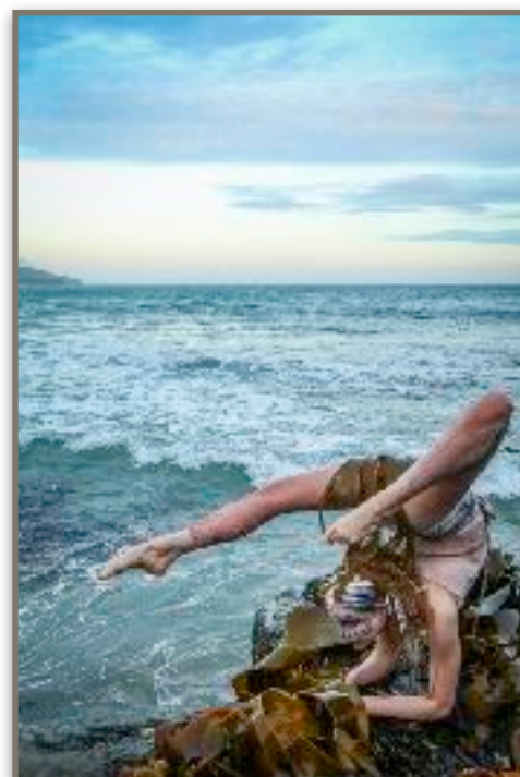
Elemental (Dunedin Fringe 2018)