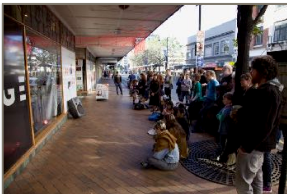
A crowd gathers on Princes St to watch a performance in 'The Black Box' @ Fringe HQ