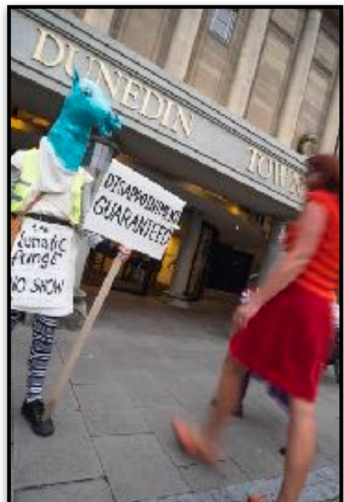
A1 The No Show, (Dunedin Fringe 2018)