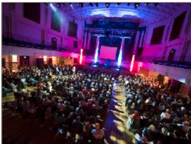
Opening Night Showcase (Dunedin Fringe 2018)